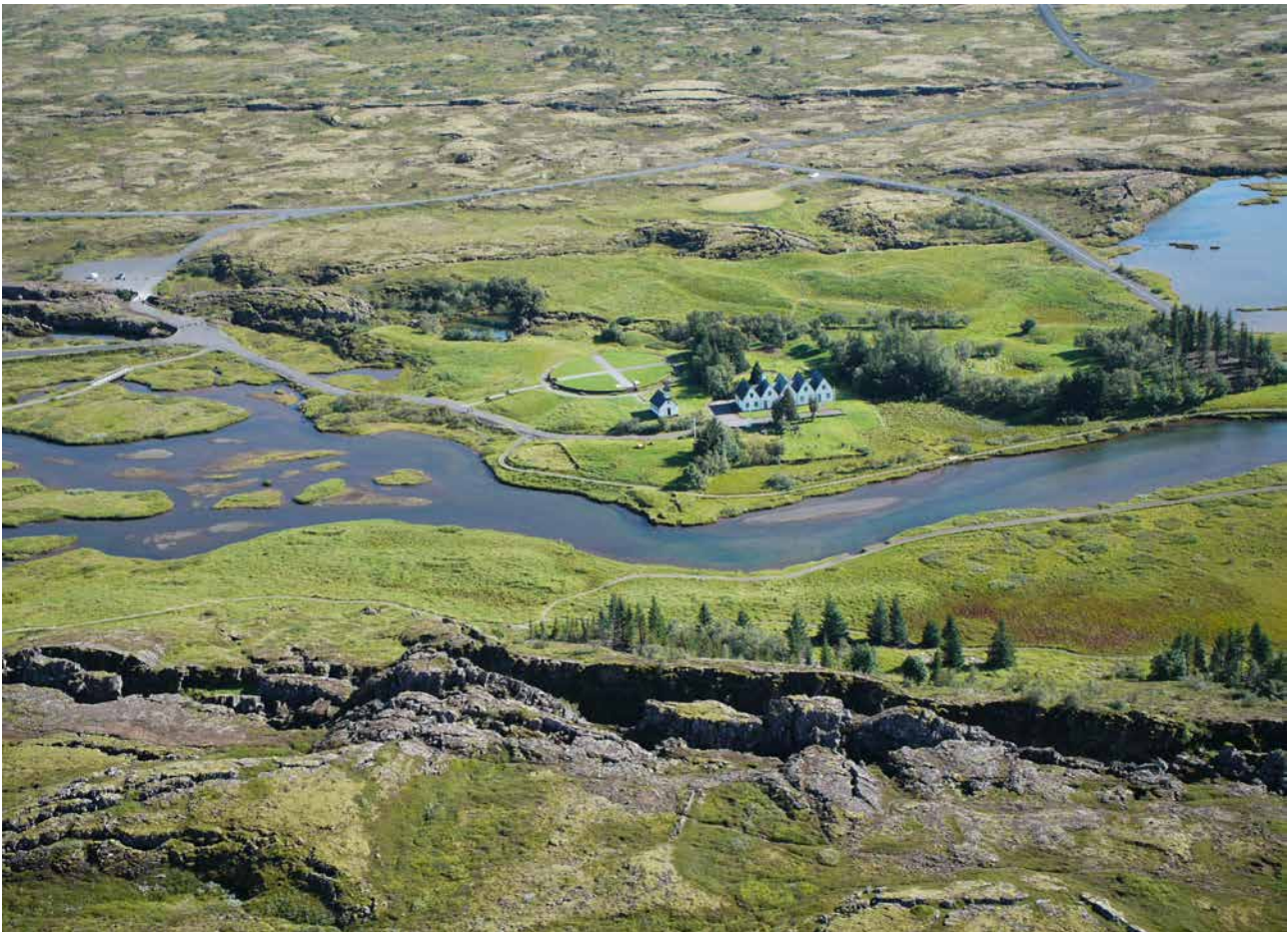
Thingvellir, Iceland: looking from the North American tectonic plate towards the European one, with the Prime Minister's summer residence at the centre of the site