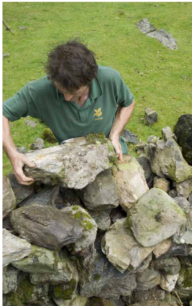
Repairing the traditional dry stone walls at Hafod Y Llan farm, Snowdonia

As an example, joint work by English Heritage and Defra on the repair of traditional farm buildings, a key but threatened part of our upland landscapes, showed not only that two thirds of these buildings would have become derelict without the conservation work, but that it created collateral benefits including employment, support for craft skills and also that every £1 of repair work generated £2.49 for the local economy.