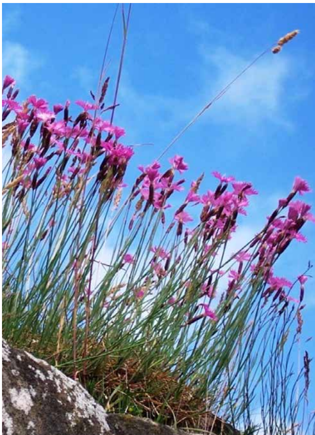
Pinks growing on the wall of Fountains Abbey ruins

last, in its buildings. The commitment to what is now called biodiversity conservation was spelled out in our 1907 Act. Our Geology Policy (Anon, 2007) sets out our approach to geological conservation and identifies many of our key sites for geodiversity.