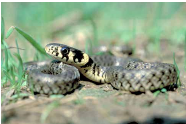
Grass snakes can be found at Saltaire World Heritage Site and other cultural sites which include suitable habitat