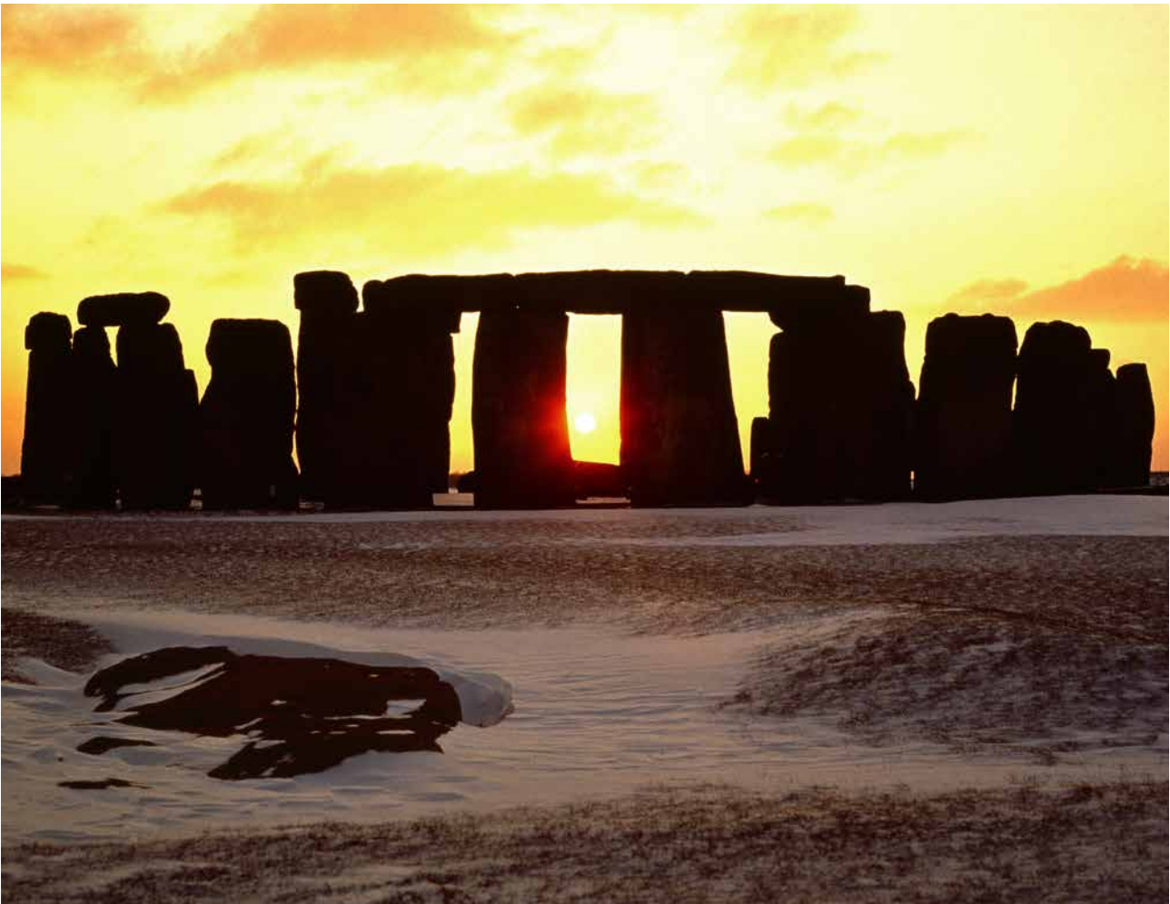
Sunset at Winter Solstice, Stonehenge

Further mutual gains can be delivered through working together on approaches to management of national natural designations such as Site of Special Scientific Interest (SSSI) and National Nature Reserve (NNR) where they fall within or adjacent to the World Heritage Site. The European Union has recently launched a programme with over €100 million for research and innovation in the field of cultural heritage under Horizon 2020 ( https://ec.europa.eu/programmes/horizon2020/ ). This programme specifically mentions the area of interface between the cultural and natural environment. Our combined data set can help provide evidence for how investment will bring both natural and historic environment gains.