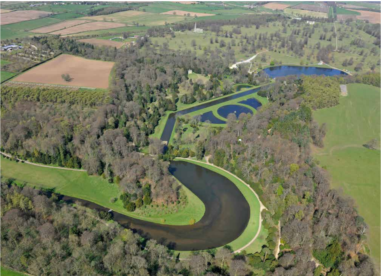
The aerial photo shows the River Skell as it flows through the Studley Royal water garden