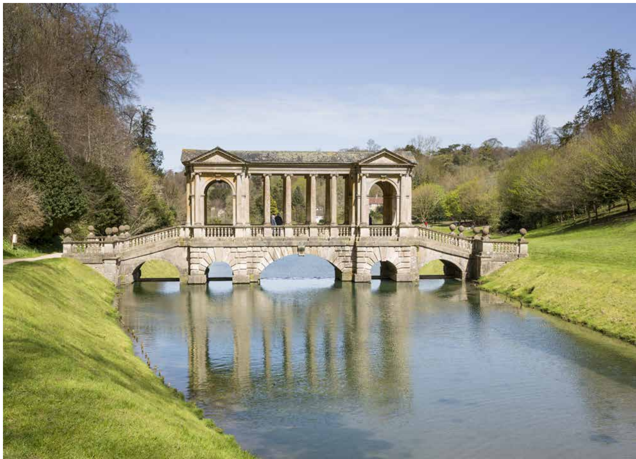
The Palladian Bridge at Prior Park

The landscape around the city is also a poor relation in terms of control. There are over 5,000 listed buildings within the Bath conservation area that are tightly controlled by planning legislation. So, whereas a building owner cannot change a door without seeking permission, a land owner can fill a field full of plastic horse jumps and similar equipment with a far greater visual impact without the need to seek