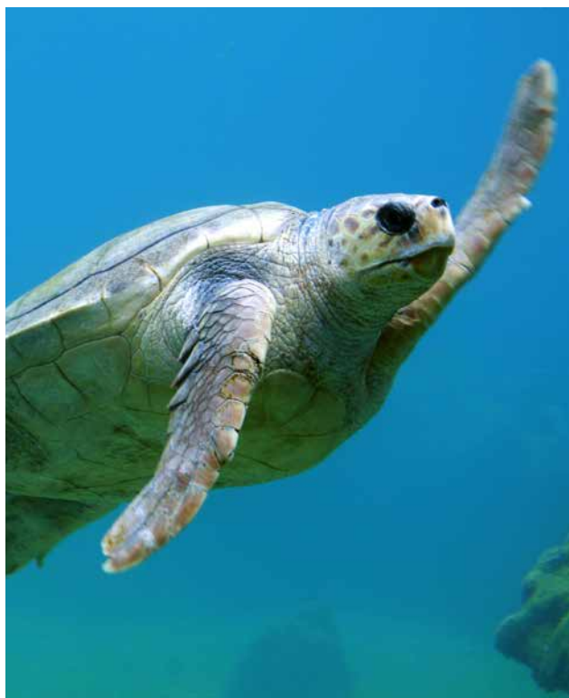
The four World Heritage Sites in the UK's Overseas Territories contain a rich biodiversity and they have many rare and endemic species, coral reefs and open ocean, including at least one whale sanctuary

Area: from the individual figures available on the UNESCO World Heritage List website, when added together, the 26 inscribed World Heritage Sites properties in the UK cover an area of over 60,000 ha (600 sq. km), nearer 100,000 ha if their buffer zones are included.