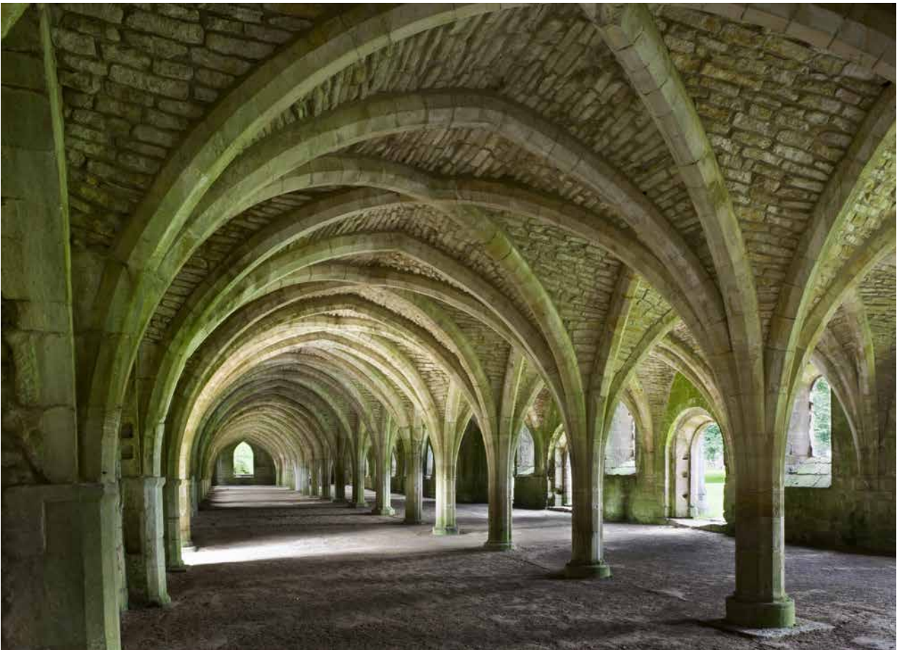
The abbey cellarium provides an important bat roost

as part of a designed landscape, raising a new range of management issues 18 .