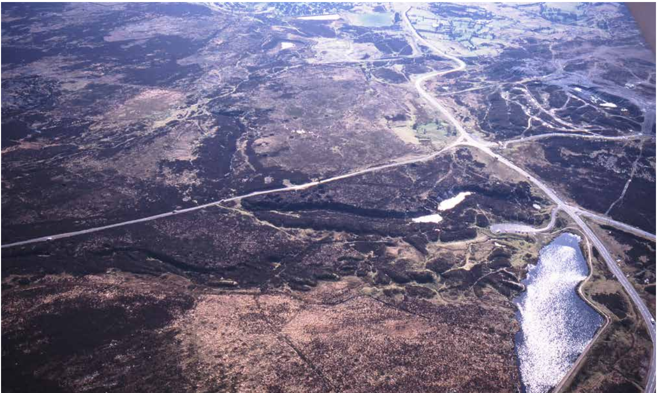
Pen Ffordd Goch