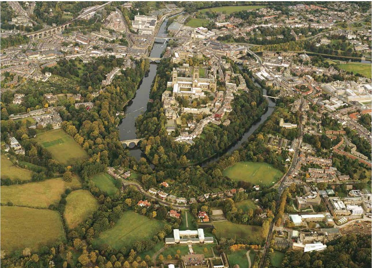
Durham Castle and Cathedral World Heritage Site – the incised River Wear meander has created the protective cathedral and castle peninsular and steep wooded river banks wrapped around the centre of Durham City

c.100,000-12,000 years ago) melt water produced vast rivers and the land started to uplift rapidly as the weight of ice was removed (a process known as isostatic rebound). As a consequence rapid erosion has cut deep gorges and steep sided river valleys into the underlying rocks. In north east England this is typified by the narrow gorge-like coastal Denes cut into the Permian Magnesian Limestone and the deepening of the Tyne and Wear Rivers. In Durham the meandering River Wear formed a deeply incised valley cutting through underlying Carboniferous Coal Measures. The resulting peninsula high ground (surrounded on three sides by the incised River Wear meander) provided the protected and defensible location for the community of St Cuthbert and the later Prince Bishops in the volatile world of northern England. The present day Durham Cathedral and Castle were built in the 11 th and 12 th centuries, their OUV reflecting the outstanding Norman and early gothic architecture and the associated relationship with the Saints Bede and Cuthbert.