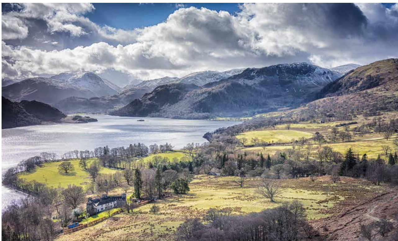
View of Ullswater from Gowbarrow. This view includes the enclosed in-by-land of Glencoyne Park, the woodland surrounding the celebrated waterfall at Aira Force and the Gothic hunting lodge of Lyulph's Tower (centre left), built in 1780 for the Earl of Surrey and one of the earliest picturesque houses in the Lake District. The daffodils in the Glencoyne woodlands inspired Wordsworth's poem 'The Daffodils' and large parts of this landscape are owned and managed by the National Trust

The English Lake District World Heritage Site whc.unesco.org/en/list/422