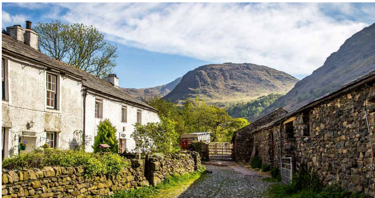
Seathwaite Farm in the Lake District

Wordsworth's views on the aesthetics of landscape and its management were outlined in his Guide and were linked to the emerging idea of the legitimacy of wider public interest and participation in the Lake District. The Guide includes his famous aspiration that