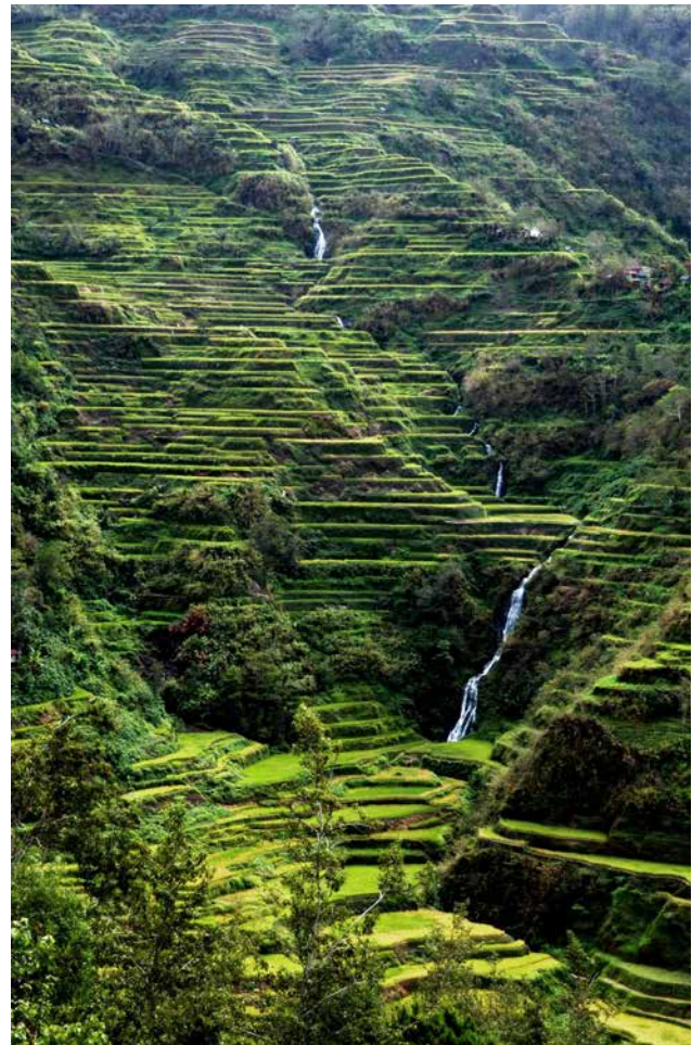
Rice Terraces of the Philippine Cordilleras: a landscape shaped by two thousand years of rice cultivation and irrigation

As with all cultural landscapes, the rice terraces are inscribed as a cultural site, yet it is the fusion of natural and cultural elements that makes it such a remarkable place. This carefully balanced system is however vulnerable to change. External economic and cultural forces threaten the social bonds that support the community traditions that help maintain irrigation and cultivation practices. For example, when young men prefer to be taxi drivers in Manila to working on the often cold and wet terraces, not only are there fewer people available to do the work on the terraces, but the community cohesion and long standing traditions that underpin the co-operative approach to farming also break down. As a result, many parts of the irrigation system have been neglected and rice growing has been abandoned in places. At the same time, there is pressure to cut down the forested watersheds, whilst the impacts of climate