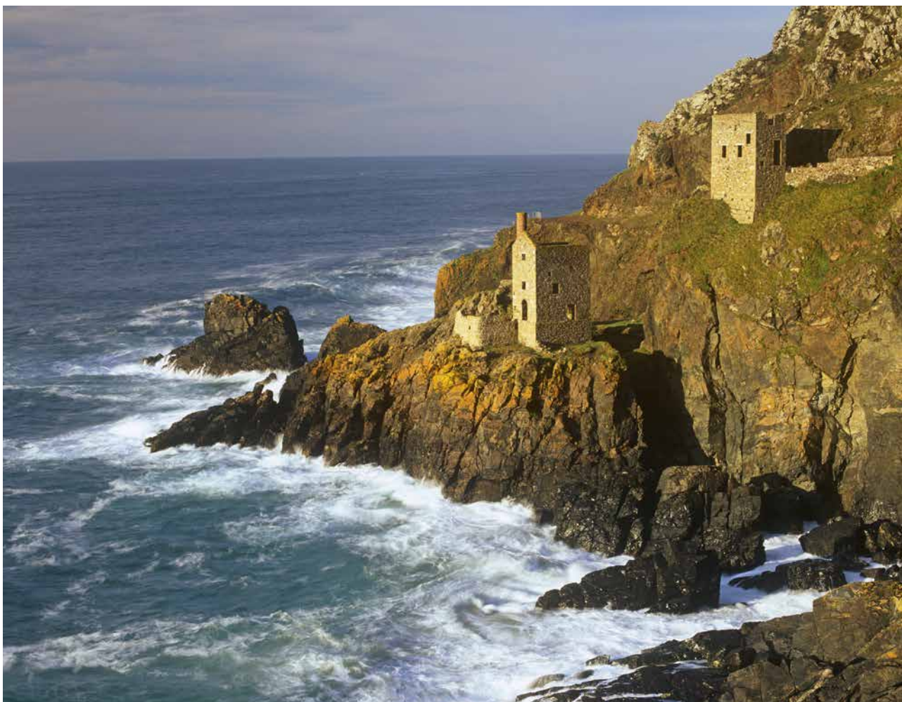
The abandoned beam engine houses of the Crowns section of Botallack Mine near St Just, Cornwall. The steam-driven engines were used for pumping water, and conveying ore and miners up and down, when the St Just area was an important centre for mining tin, copper and other minerals

sector. Such approaches are also contrary to the principles of the European Landscape Convention (ELC) which defines landscape as “ an area, as perceived by people, whose character is the result of the action and interaction of natural and/or human factors ”.