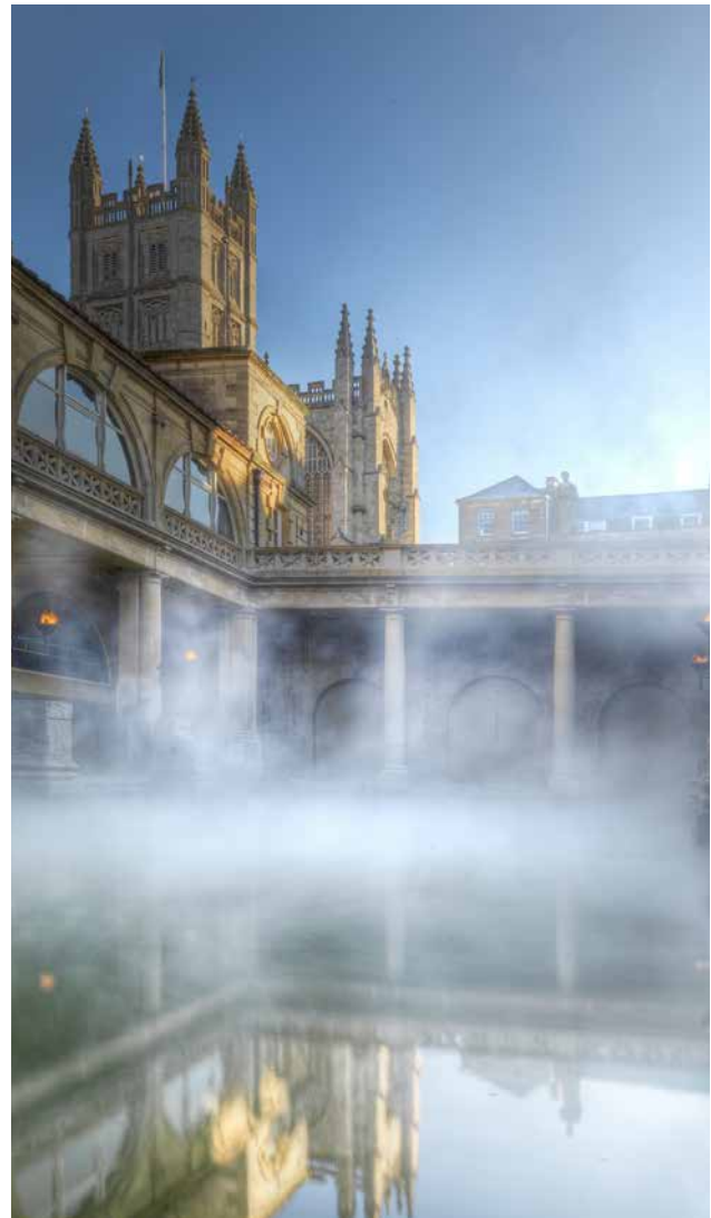
Natural hot springs supply the Roman Baths

Holistic management and the breaking down of divides between the approach to cultural and natural heritage is essential. Bath, the beautiful city, is a desirable place to live and the demand for housing and employment has largely been unchecked by the recent recession. Fortunately, the withdrawal of the Ministry of Defence (naval support offices) from the city has provided enough ‘brownfield’ land for 3,000 homes, which are currently the subject of planning applications. If current market conditions (2014), however, are sustained, this windfall will only buy a respite of maybe five years before the search for more housing sites begins again. It must be ensured that the green field setting of the city is not viewed merely as ‘undeveloped land’, but fully recognised that it is already fully in legitimate use in providing the backdrop and balance to the urban form. The green landscape is as essential to Bath as the canals are to Venice. We must be prepared to grant the natural equal recognition and value to that of the cultural.