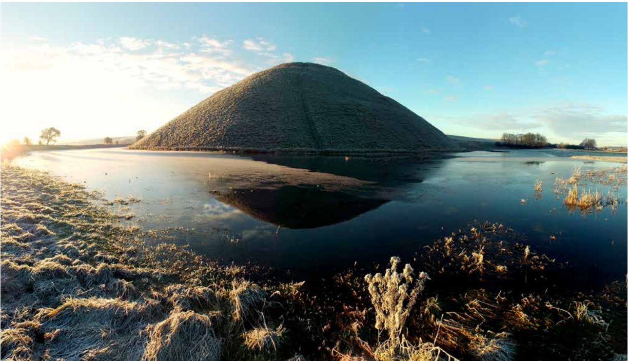
Silbury Hill – winter flooding around the base of the hill

the monument. Many of the barrow cemeteries in the World Heritage Site were clearly built on prominent ridge-lines for visual impact. Though its original function is uncertain, the Stonehenge Cursus seems to have been laid out to link outward views over the Till and Avon valleys.