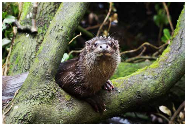
Otters ( Lutra lutra ) breed at Pontcysyllte Aqueduct and Canal World Heritage Site