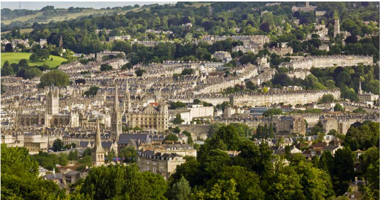
The skyline of Bath, seen from Prior Park Landscape Garden