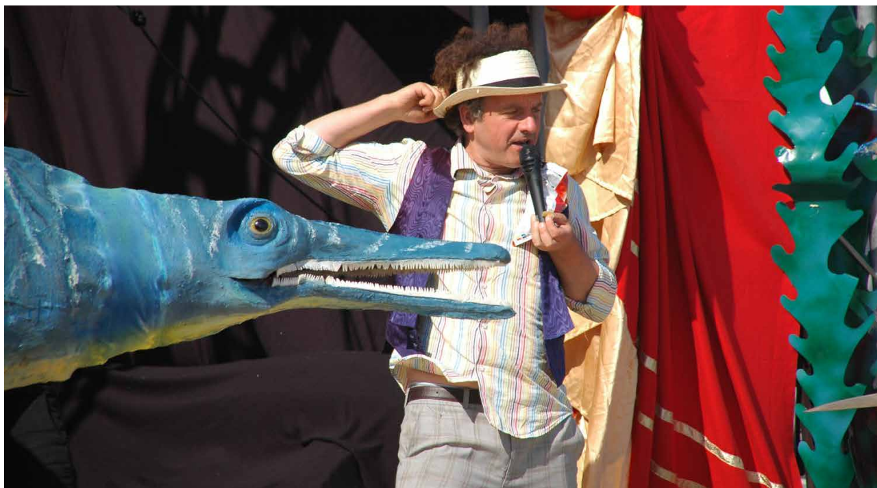
Herbie Treehead's Dinosaur Circus, Lyme Regis Fossil Festival

that can help to make those connections, such as the widespread use of Portland Stone in London and around the world, or the use of Beer stone in Exeter Cathedral. In trying to engage people with the Jurassic Coast on Portland, we refer to the stories of stone because this is the strongest cultural reference linking people's lives to natural heritage. Then going on to say that the stone is 145 million years old and part of a continuous sequence from Exmouth through to Studland encompassing the period of life from the dawn to the death of the dinosaurs. This is a huge leap to expect them to make, but one which they may engage with more, simply by looking at the fossils in the Portland stone that their houses are built from.