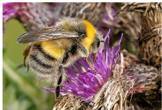
Now only found in northern Scotland the great yellow bumblebee ( Bombus lucorum ) can be seen at the Heart of Neolithic Orkney World Heritage Site