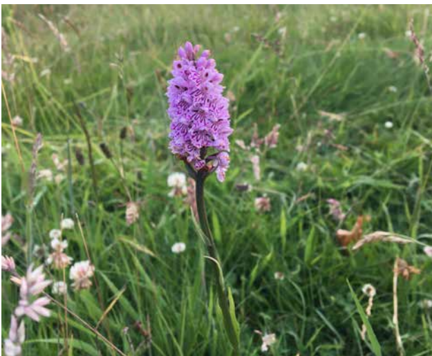
Common spotted orchids ( Dactylorhiza fuchsia) can be found in many of the UK's coastal and inland World Heritage Sites where there is suitable habitat for it

Nature is everywhere. Making the very fabric of ancient buildings and monuments and on their walls, in the grounds of stately homes, in the canals and spoil heaps of our industrial past, in the air above our towns and cities and especially in the seas and islands of our territorial responsibilities abroad. However, knowledge of nature was thought to be generally lacking in most UK World Heritage Sites, or at least dispersed. It was considered useful to understand better and recognise the contribution to nature conservation made by "cultural" and "mixed" World Heritage Sites as well as those inscribed as "natural" sites and to begin to gain an appreciation of their collective value..