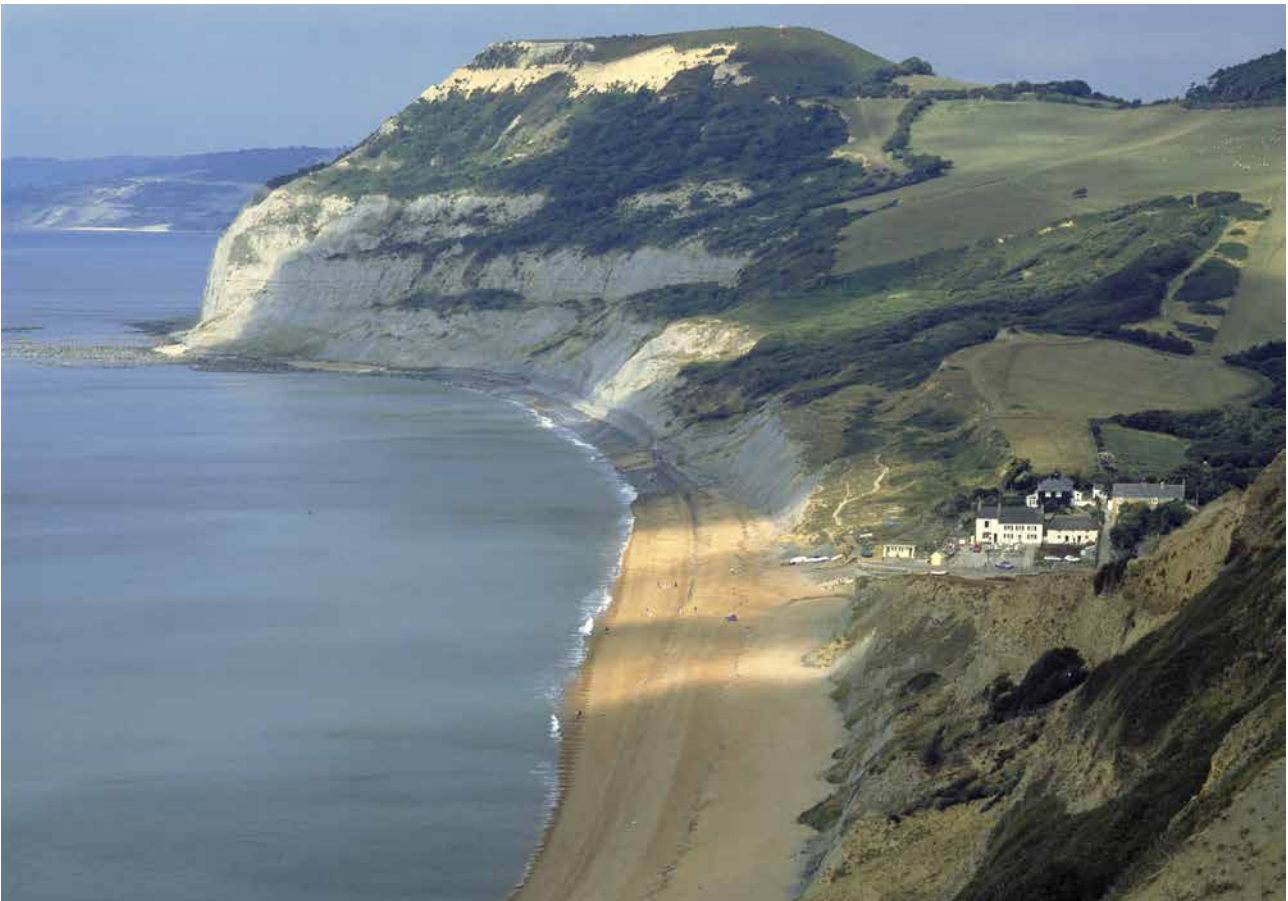
View from Ridge Cliff looking west to Golden Cap, Dorset

The most southerly mile of the beach, however, is managed as a sea defence for the heavily populated Portland Underhill area, so is restricted from acting naturally. This conflict between natural forces and property – for some people the very essence of the nature / culture interaction – is, and always will be the most challenging part of site management and needs to be dealt with pragmatically and sensitively.