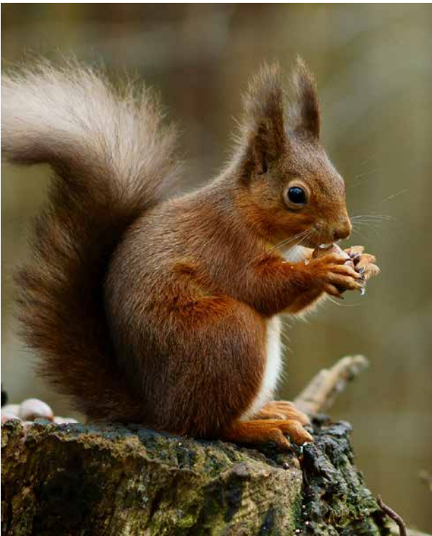
One of the last strongholds of the red squirrel ( Sciurus vulgaris ) is the recently inscribed English Lake District World Heritage Site

comprehensive or up to date audits of the biodiversity in these areas. However, it is relatively easy to get an impression from the information the research has generated that there is a considerable volume of species of nature conservation interest in all categories of World Heritage Sites, and this includes some National Biodiversity Action Plan (Defra, 2012) priorities and other species of conservation concern. The presence of bats is frequently noted in World Heritage Sites. Indeed, it may be possible to suggest that each World Heritage Sites may have at least one flagship species or habitat of its own to champion. Some examples are included in Table 3 below.