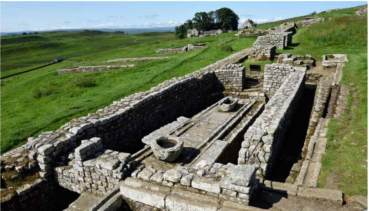
Roman latrines at Housesteads Fort, Hadrian's Wall, Northumberland. This is one of the Roman Empire's best maintained outposts in Northern Europe