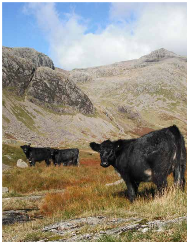
Cattle grazing on the Great Moss below Scafell Pike

We will need to identify sources of funding for the development of a more sustainable system of integrated land management and to ensure that it is economically viable in the long term. Following the UK's decision in 2016 to leave the European Union, there is great uncertainty over the nature and level of agri-environment grant schemes after 2020. It is also a weakness that there are currently no grant schemes for conserving important cultural landscapes. This is likely to increase the need for profitability of the farming system itself and in this regard the recent award of Protected Designation of Origin (PDO) to Herdwick mutton could be of assistance. This could prove to be an important marketing