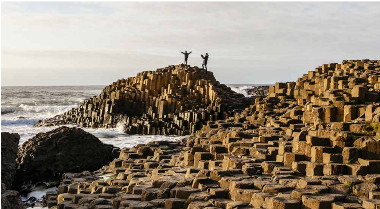
Visitors at the Giant's Causeway