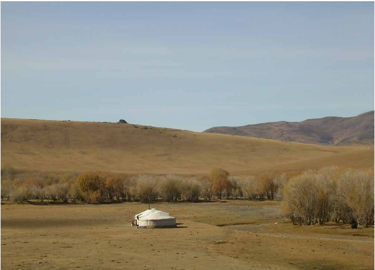
Orkhon Valley