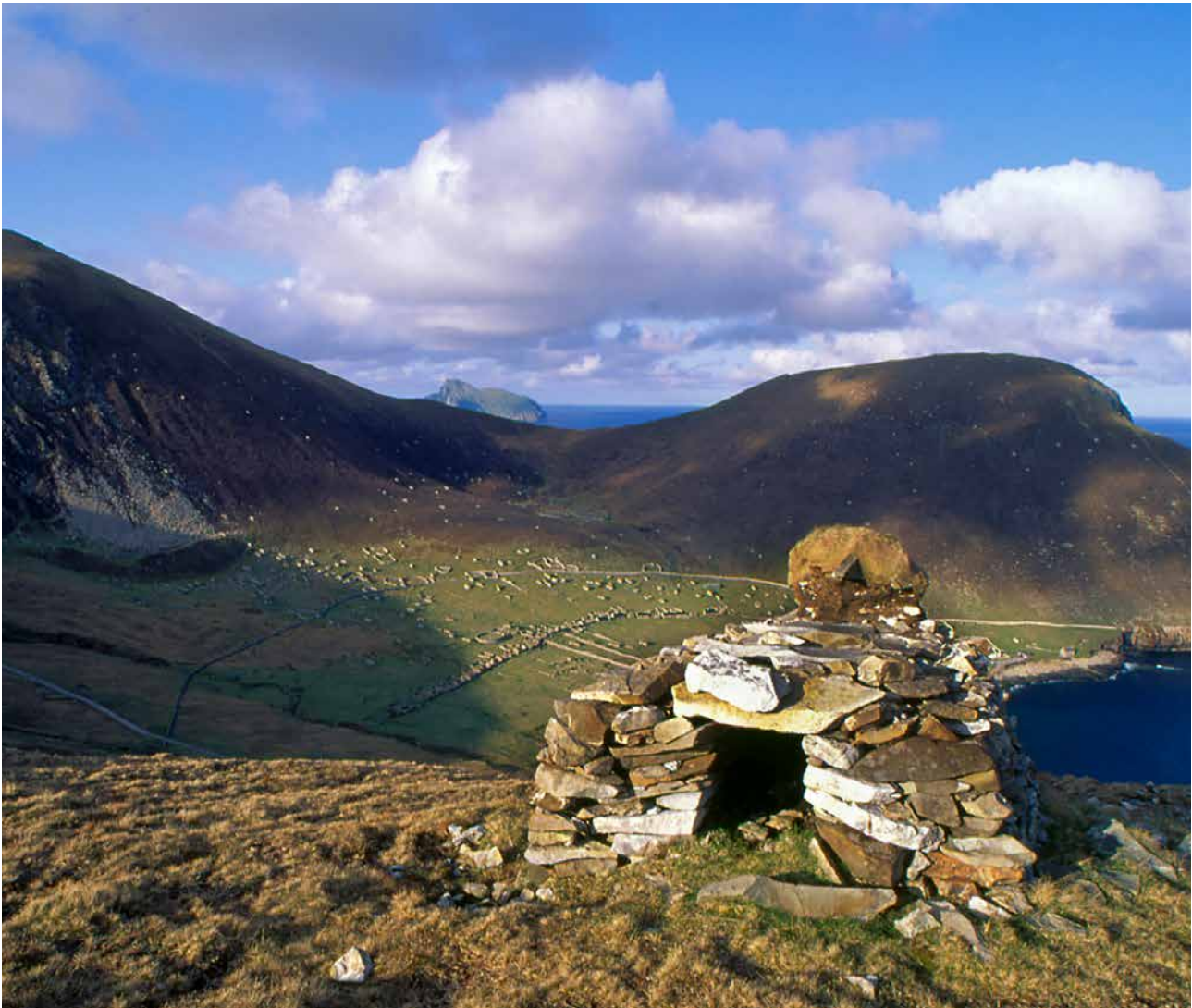
St Kilda is the only World Heritage Site in the UK inscribed as a 'mixed' site for its natural and cultural heritage