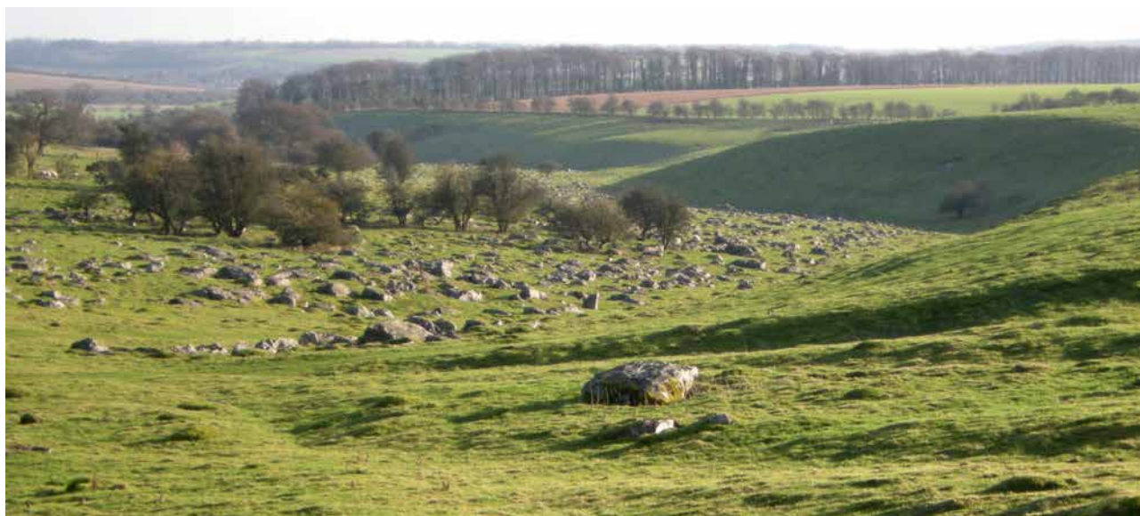
Valley of the Stones, sarsens lying where they were formed in Fyfield Down NNR, Avebury