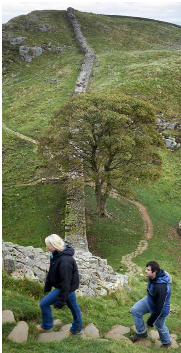
Hadrian's Wall long distance National Path, Steel Rigg, Northumberland

Framework. Primary Theme: The north-west frontier of the Roman Empire. Hexham: Hadrian's Wall Heritage Ltd.