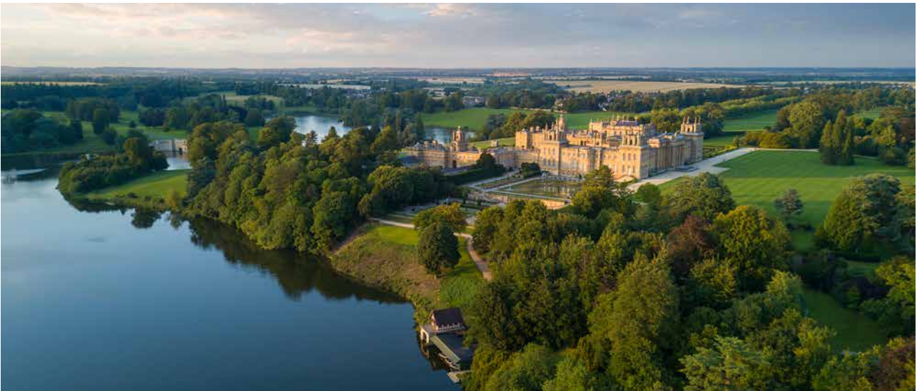
Blenheim Palace World Heritage Site – naturally cultural or culturally natural? The 18th century Palace was designed by the architects Vanbrugh and Hawksmoor and is faced with locally quarried Clypeus Grit limestone. The Lancelot “Capability” Brown Parkland, which modifies the River Glyme, is considered one of the greatest examples of naturalistic landscape design