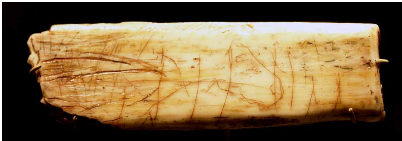
The Ochre Horse – the oldest known carving of its type in Britain

By the end of the 20 th century Creswell Crags was already well established as a site of national/ international importance for the study of Pleistocene cave deposits and Palaeolithic cave artefacts. In 1981 it was notified as a Site of Special Scientific Interest recognising its rich fossil vertebrate fauna, in 1985 it became a Scheduled Monument reflecting the evidence of hominid occupation. What lifted it into a new orbit was the discovery in April 2003 of Britain's only confirmed Ice Age cave art.