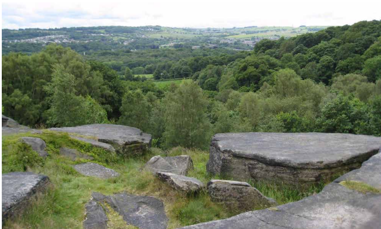
Rural views around parts of Saltaire World Heritage Site are little changed

Management Plan need to reflect multi-agency and multi-disciplinary partnerships. Objectives for conserving and developing the natural elements need to be more fully understood by those managing the built heritage and vice versa. But more than that, those objectives need to be truly shared. In a large site such as this, with its 1000 ha of buffer zone, numerous Council departments need to work together alongside a range of external partners such as Canal and River Trust, Baildon Town Council, Environment Agency and community groups involved in green spaces and the countryside.