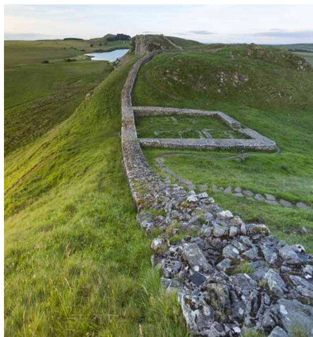
Hadrian’s Wall and Milecastle looking eastwards along the Whin Sill Escarpment and towards Crag Lough

Hadrian’s Wall (Frontiers of the Roman Empire World Heritage Site): the same Carboniferous mountain building led to the emplacement of the dolerite Whin Sill across northern England. Today this forms the Farne Islands,