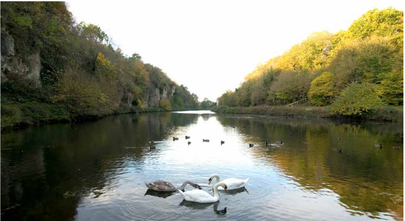
Creswell Crags: today the Magnesian Limestone gorge is artificially flooded and gorge sides wooded with cave entrances on both sides of the gorge