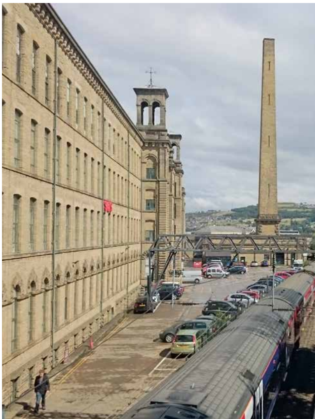
Salt's Mill, Saltaire

The natural setting of the World Heritage Site is highly designated, mirroring the cultural importance of Saltaire. To the north lies Rombalds Moor, which includes the famous Ilkley Moor, and is part of the South Pennine Moors Site of Special Scientific Interest (SSSI). This is the highest national