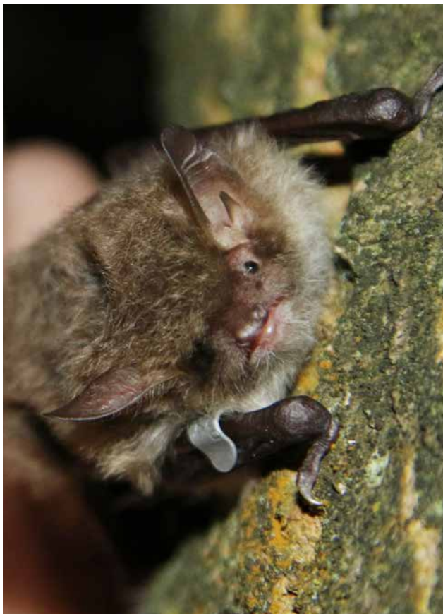
Natterer's bat, Cliveden