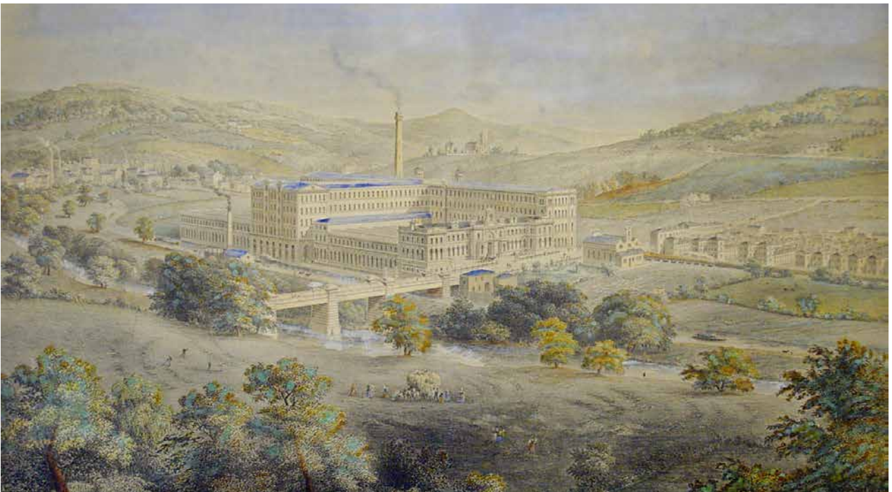
A picturesque interpretation of fields and country yokels above Saltaire in the 1850s